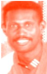
Rellysdom Malakana Media, Diocese of Gizo

This month of September the church celebrate the following feast days.